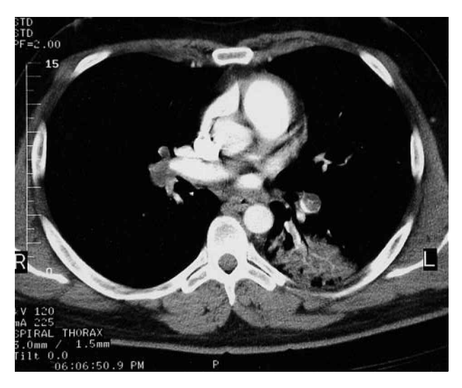
Fig. 3.—Helical computed tomography angiogram showing thrombus in both lower lobe pulmonary arteries with a wedge-shaped consolidation in the superior segment of the left lower lobe.

It will be necessary to obtain some estimate of the degree of risk associated with immobility while sitting using a computer, to enable appropriate recommendations to be made regarding prophylaxis. With the